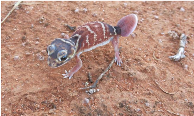
Nephurus levis Smooth Knob-tailed Gecko