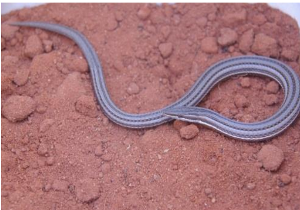
Lialis burtonis Burton's Snake-lizard