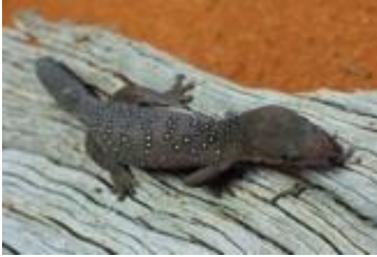
Strophurus elderi Jewelled Gecko