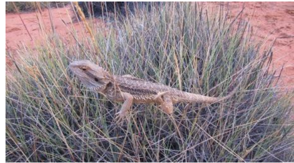
Pogona vitticeps Eastern Bearded Dragon