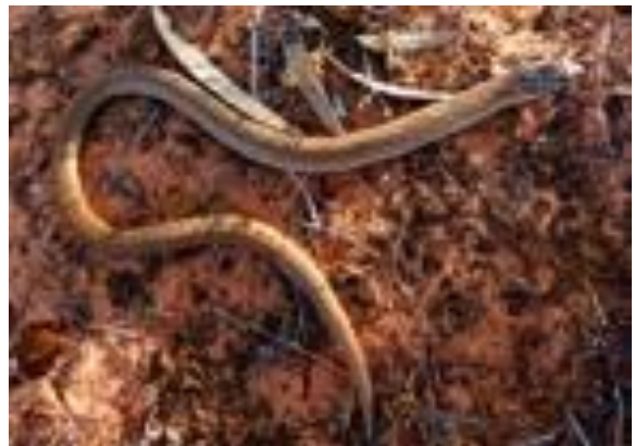
Pygopus nigriceps Hooded Scaley-foot