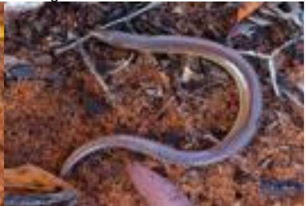
Lerista punctatovittata Speckled Short-limbed Skink