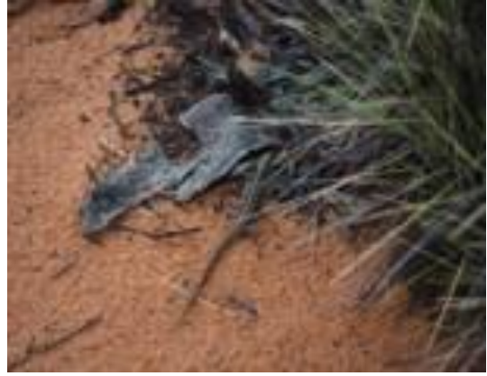
Ctenotus regius Royal Ctenotus