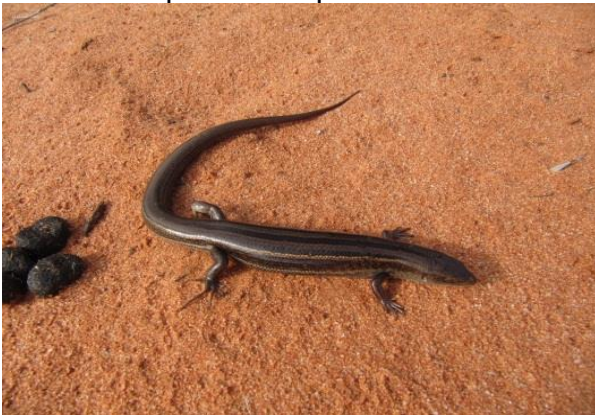
Ctenotus brachyonyx Skink