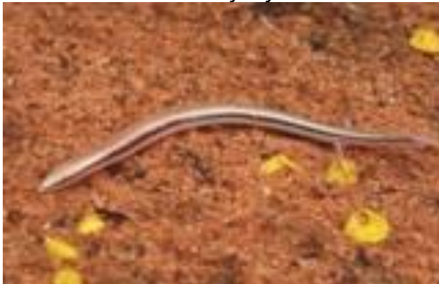
Lerista labialis Pink Lerista