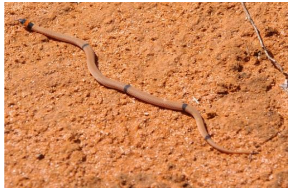
Pseudonaja modesta Ringed Brown-snake