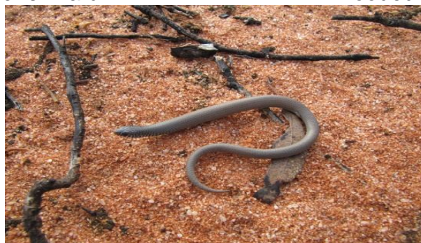
Delma australis Southern Legless Lizard