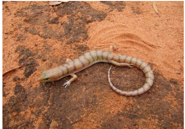
Eremiascincus richardsonii Broad-banded Sandswimmer