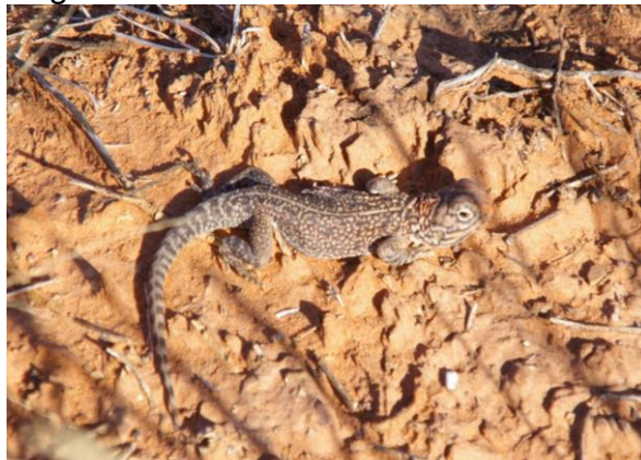
Ctenophorus nuchalis Central Netted Dragon