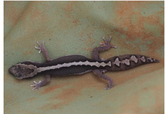
Diplodactylus vittatus Eastern Stone Gecko