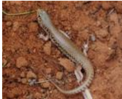
Egernia inornata Desert Skink