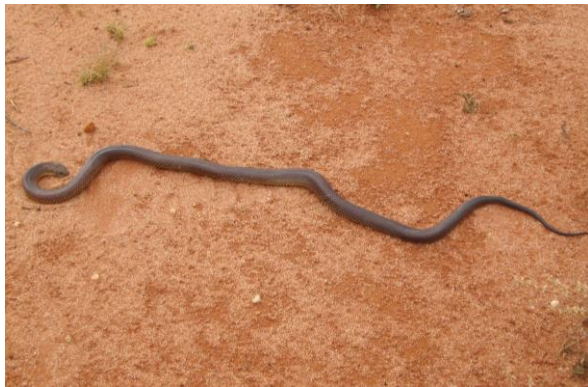
Pseudechis australis King Brown Snake