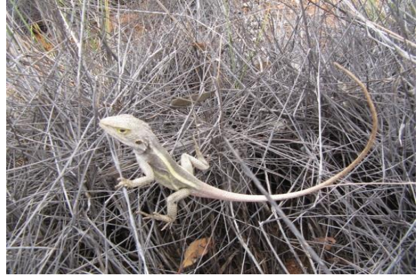
Amphibolurus nobbi Nobbi Dragon