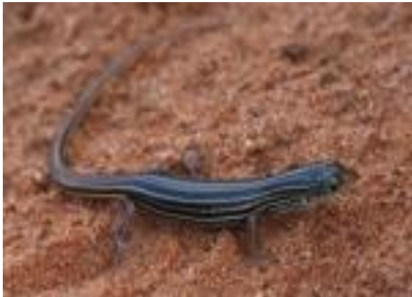
Ctenotus atlas Spinifex Striped Skink