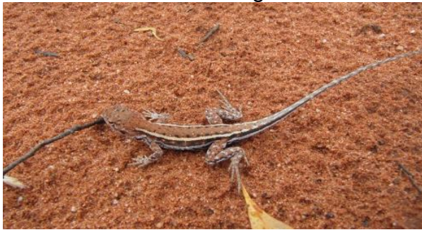
Ctenophorus fordi Mallee Dragon