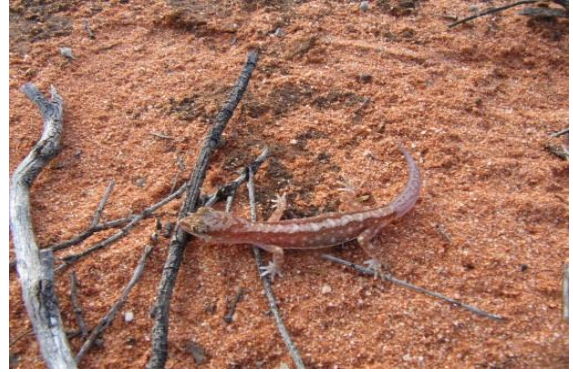
Dyplobactillus damaeus Beaded Gecko