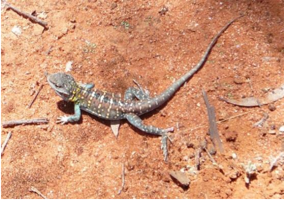
Ctenophorus pictus Painted Dragon