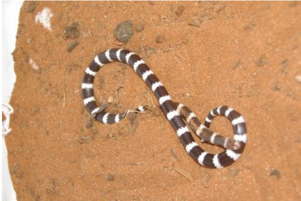
Vermicella annulata Bandy-bandy