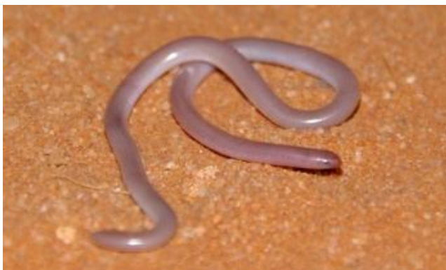
Rhamphotyphlops australis Southern Blind Snake