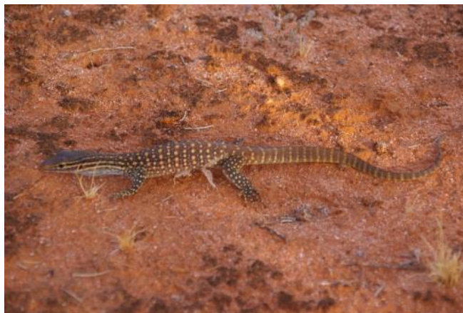
Varanus gouldii Sand Goanna