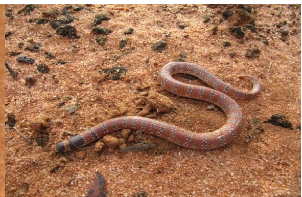
Simoselaps australis Coral Snake