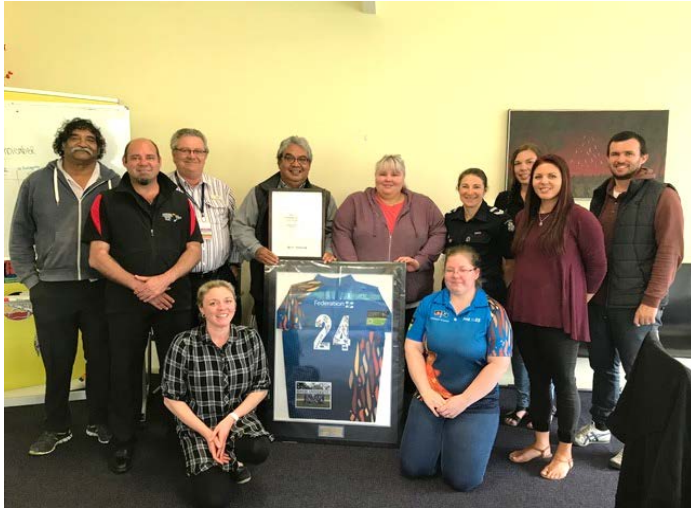
Some of our amazing Sponsors and Participants;

On the 25 th of October, the AEC hosted an event to thank all of our sponsors and students/participants. This event was held in Ballarat and gave the opportunity for sponsors to meet the students, and to show our appreciation for the community's contribution in getting the inaugural FedUni team to the Indigenous University Games in Geelong.