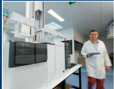
High sensitivity GC QQQ MS