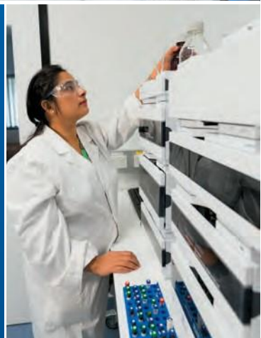
Multi detector Bio-inert HPLC

The CTRC have been recently awarded a Victorian government grant to investigate upgrading coal based liquid fertiliser products for Omnia Specialities (Pty Ltd). This continues our long association with local industries in value adding to coal products.