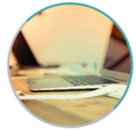
Online, after-hours tutoring