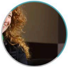
Learning Skills Advisors

Log in to FedReady Online: Self-Paced to complete the course online.