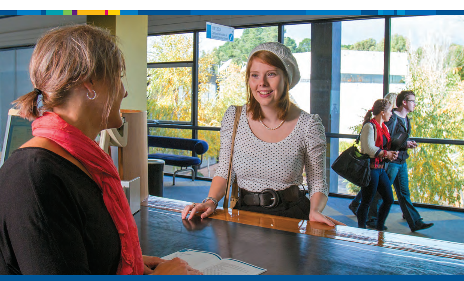
Learn to succeed | 1800 FED UNI | federation.edu.au